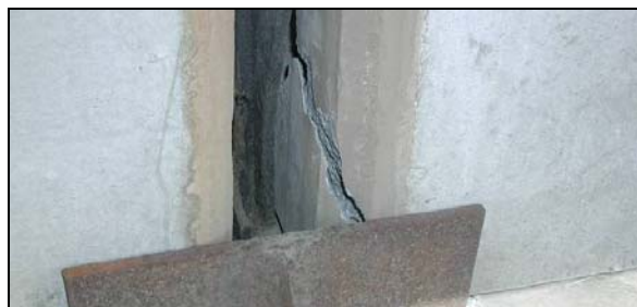
Figure 10. Cracked Girder Corner after Bearing Pad was Glued in Place

Figure 11 shows bent and broken anchor bolts on the 42-foot span of the SOA bridge. The span has moved outward slightly on the 5-degree curve.