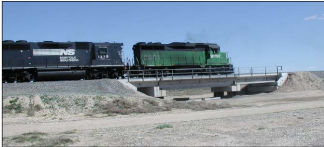
Figure 1. SOA Concrete Bridge at FAST

With the increasing use of concrete bridges to replace timber bridges on HAL corridors, it is important to understand their performance. Two new concrete bridges were installed at FAST in December 2003. A variety of tests are being conducted under 315,000-GRL traffic, many of which have been reported previously. 1,2,3 The purpose of this report is to summarize the general performance of the bridges to date. Figures 1 and 2 show the state-of-the-art (SOA) and conventional concrete bridges installed by TTCI at FAST.