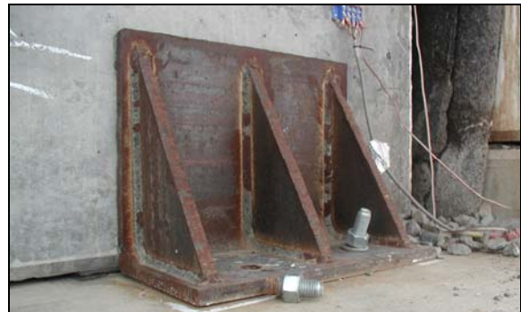
Figure 11. Bent and Broken Anchor Bolts on SOA Bridge

During a normal track surfacing operation, a regulator struck the ballast curb at the southwest corner of the conventional concrete bridge. This appears to have caused a crack in the curb. Figure 12 shows the ballast curb crack.