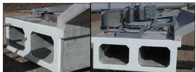
Figure 5. Repaired Concrete Box Girder A (left photo) and Figure 6. Box Girder B (right photo)