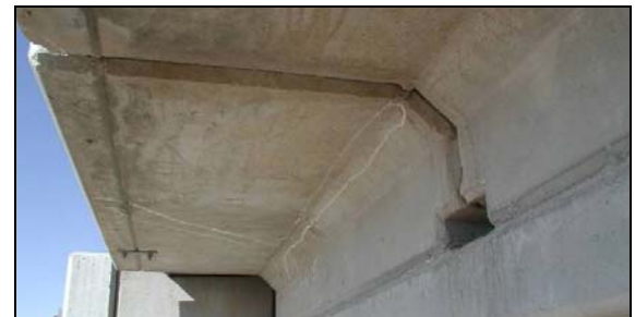
Figure 12. Ballast Curb Crack after Regulator Strike