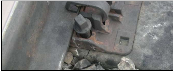
Figure 13. Cracked Composite Tie with a Loose Screw Spike