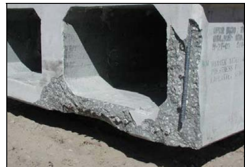
Figure 4. Damaged Concrete Box Girder B before Repair