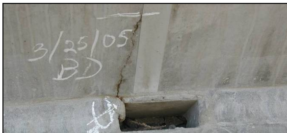
Figure 8. Largest Crack near Deck Drain Opening