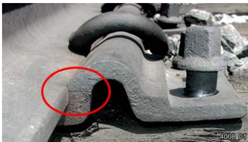
Figure 15. Cracked Pandrol Plate with Loose Screw Spike

Thirty-six timber ties (oak) on the conventional bridge accumulated 335 MGT of 315,000-pound GRL traffic. Some ties became slightly skewed so that the rail is wearing into the inside of the curved part of the Pandrol plate causing a crack. Figure 15 shows a cracked Pandrol plate with a loose screw spike on the high rail of the conventional bridge. This wearing caused the cracking of 12 tie plates, all on the high rail. Four of the plates were side by side. All 12 plates were replaced. Two of the plates had the screw spikes broken off. Others had loose screw spikes. A cut spike was used to hold each plate temporarily. Similar problems have been noted in the tie and fastener experiment at FAST. 4