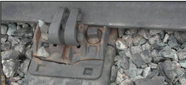
Figure 14. Broken Tie Plate on Cracked Plastic Composite Tie