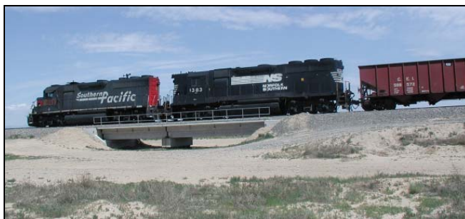
Figure 2. Conventional Concrete Bridge at FAST

One bridge features three SOA spans, including a 15-foot slab span, a 42-foot high performance concrete double voided box girder, and a 30-foot double voided box girder. The 15-foot slab and 30-foot box girder spans were donated by the Union Pacific (UP). They were designed to the new UP/BNSF Railway (BNSF) joint standards, including the current American Railway Engineering and Maintenance of Way Association design load of Cooper E-80. The 42-foot high performance span was designed and donated by Canadian National, featuring a concrete strength of 9,000 pounds per square inch (psi), and a Cooper E-90 design load.