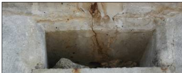
Figure 7. Typical Cracking near Deck Drain Opening

Figure 9 shows a bearing pad on one span at the center pier of the conventional bridge that had a tendency to work its way out from under the girder. To restrict movement, this pad was glued to top of the pile cap. Shortly thereafter, a crack was observed at the girder corner nearest that pad, as Figure 10 shows.