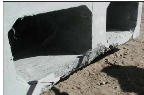
Figure 3. Damaged Concrete Box Girder A before Repair

Both of the 30-foot concrete box girders were damaged during transport from the precasting plant to FAST. The damage was mainly at the girder ends (see Figures 3 and 4). The concrete was repaired using Sikadur High Mod 33 (two-part epoxy) mixed with dried masonry sand. This is considered a 10,000 psi grout. The repair was then covered with a skim coat of Hilti RM800. The repairs were performed in the field at FAST by the manufacturer. The repairs were performed before the girders were installed in the bridge, as Figures 5 and 6 show. After 517 MGT of 315,000-pound GRL traffic, no chipping or spalling is evident in the repaired areas.