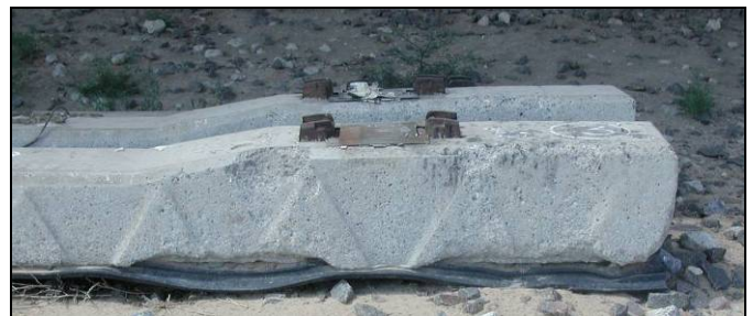
Figure 17. Concrete Ties with Cast-In Rubber Pads