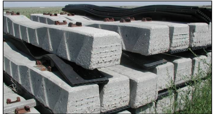
Figure 16. Concrete Ties with Glued and Unglued Rubber Pads

Two generations of UP prestressed concrete ties with rubber pads attached to the bottoms have been installed on the SOA bridge for over 100 MGT each. The first generation ties featured rubber pads glued to the bottoms. After 130 MGT, the rubber showed no signs of wear. But the pads became partially unglued on some ties, as Figure 16 shows. The second generation ties featured rubber pads cast into the bottoms. After 155 MGT, some deterioration of the interface was evident near the edges, as Figure 17 shows.