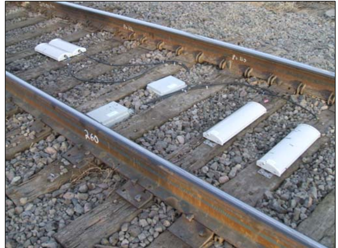
Figure 5. Antennae Mounted Between Rails