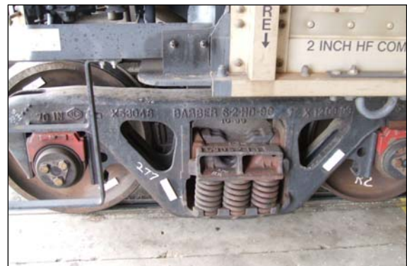
Figure 2. RFID Tags Bonded to the Side Frames

Twenty-six RFID tags were glued with epoxy adhesive onto the bolsters, side frames, wheels, and axles of three 125-ton capacity gondola cars, as Figures 2 and 3 illustrate. In addition, the couplers of the three cars were also instrumented with RFID tags. Two of the carbodies were aluminum and one was steel.