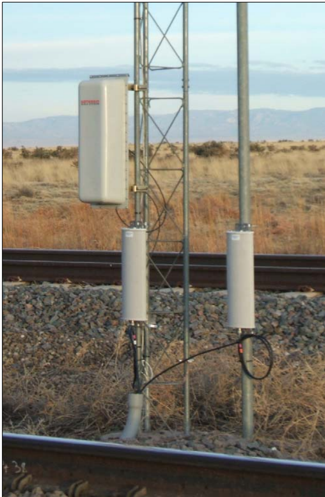
Figure 4. Tower Mounted Antennae

The wayside installation is located in a tangent section on the HTL. The location has a bungalow close to the track with two tri-leg towers next to the track. A total of eight antennae are being used in various orientations and configurations to determine which combination is best able to scan the tags mounted on the cars. Two antennae were mounted vertically on either side of the track. Figure 4 shows one of these antennae. Four antennae were mounted between the rails, as Figure 5 shows. In addition, an automatic equipment identification reader was installed to correlate the car number to the RFID tags on that car. There is also a web camera with pan/tilt capability mounted to the top of one of the towers. This allows remote monitoring of the site while testing is in progress. Alien Technologies supplied the tags, antennae, and camera. The three scanners and a web camera are accessible by using the TTCI wireless local area network.